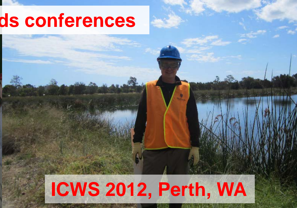
ICWS 2012, Perth, WA