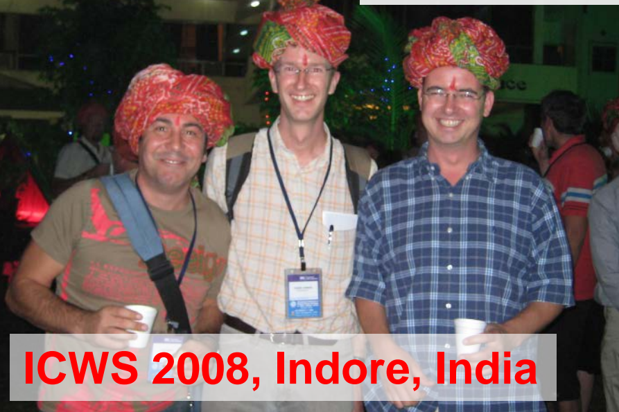
ICWS 2008, Indore, India