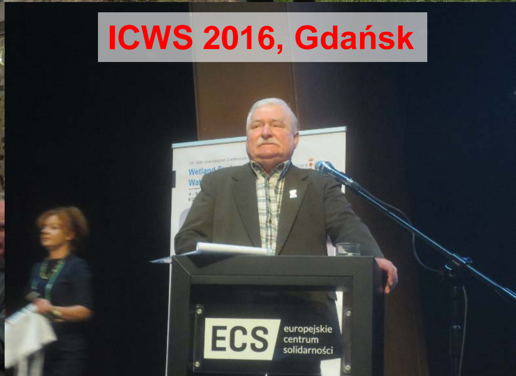
ICWS 2016, Gdańsk