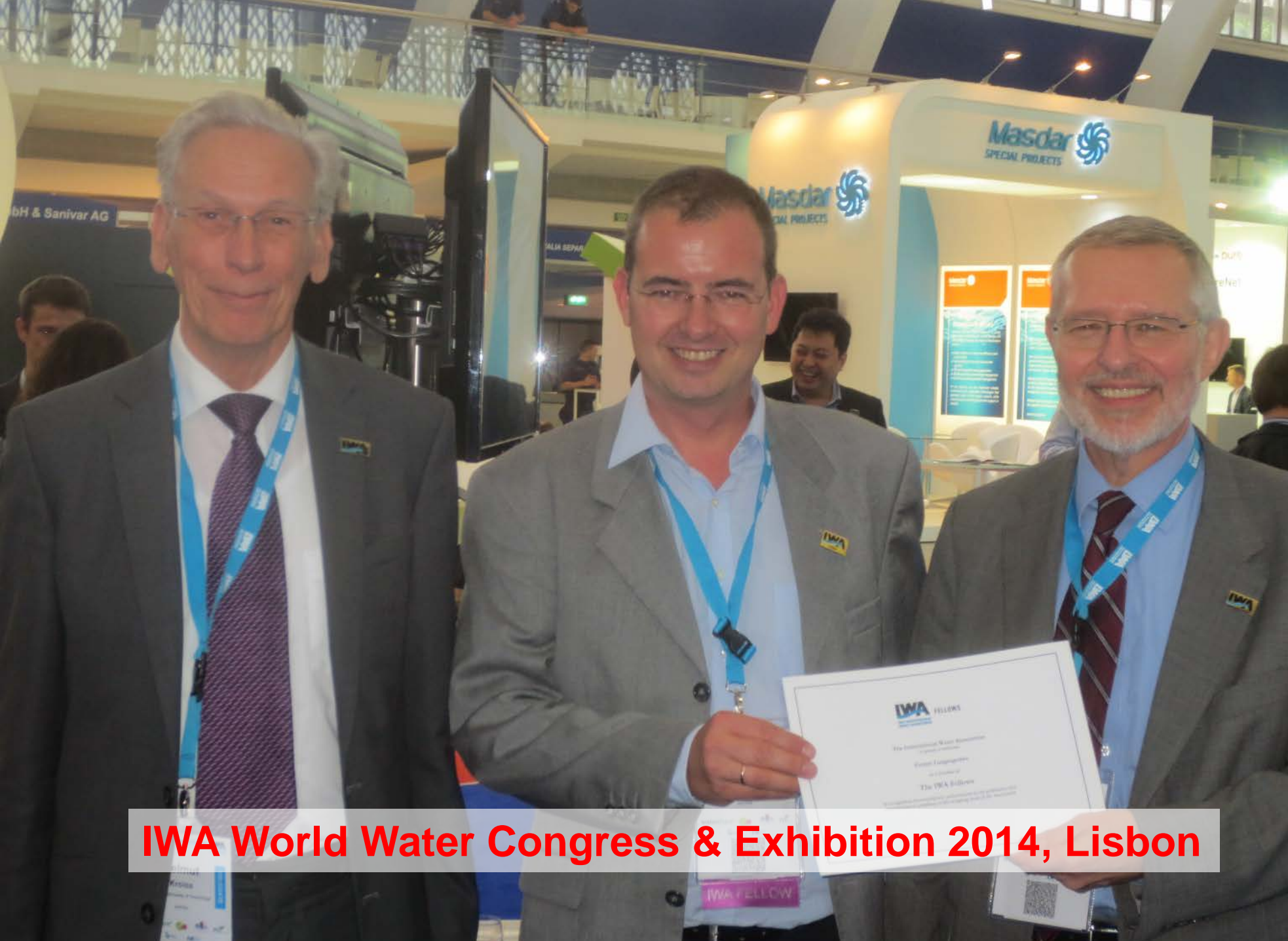
IWA World Water Congress & Exhibition 2014, Lisbon