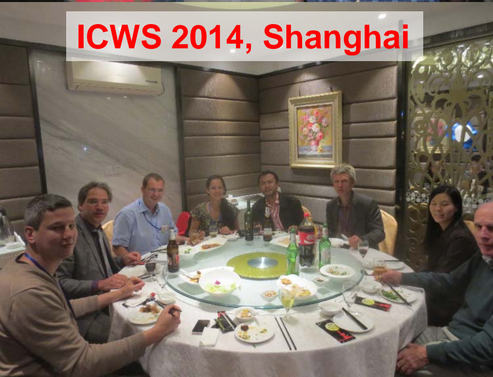
ICWS 2014, Shanghai