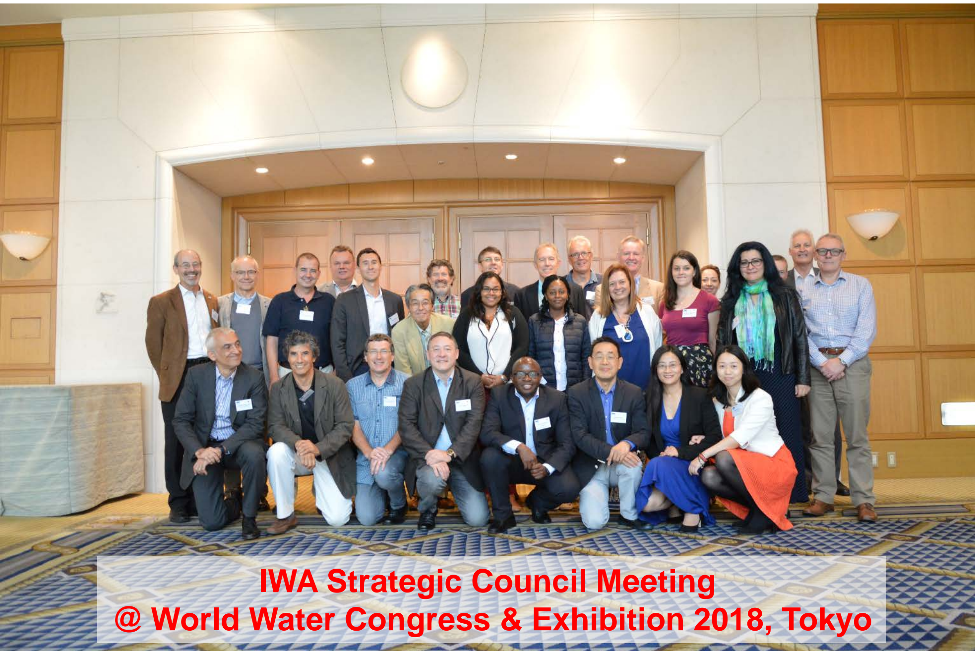
IWA Strategic Council Meeting @ World Water Congress & Exhibition 2018, Tokyo